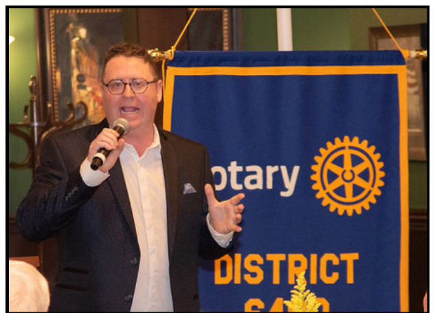
Nearly Two Years in the Making, D6490 Million Dollar Dinner a Huge Success!