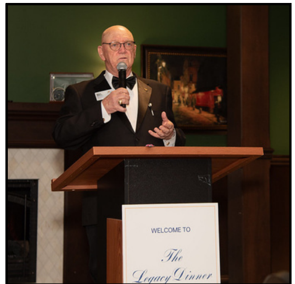
$1.6M from 31 Donors!