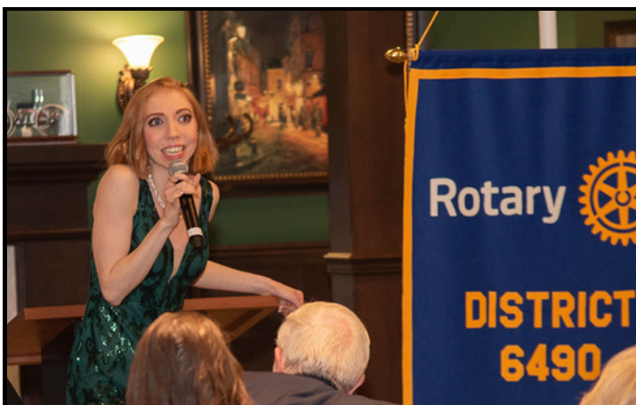
Thank you D6490 Legacy Dinner Planning Team, Supporters & Volunteers for a Job Well Done!